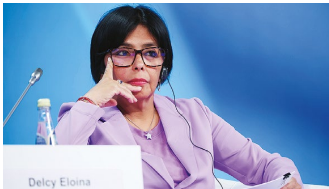
Delcy Eloína Rodríguez Gómez

Vice President and Minister of Oil of Venezuela