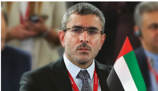
Sharif Salim Al-Olama

Undersecretary for Energy and Petroleum Affairs of the UAE Ministry of Energy and Infrastructure