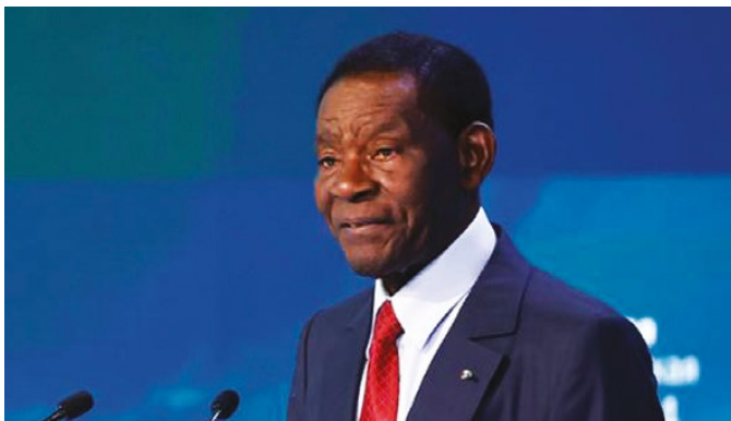
Teodoro Nguema Obiang Mangue

Vice President of the Republic of Equatorial Guinea